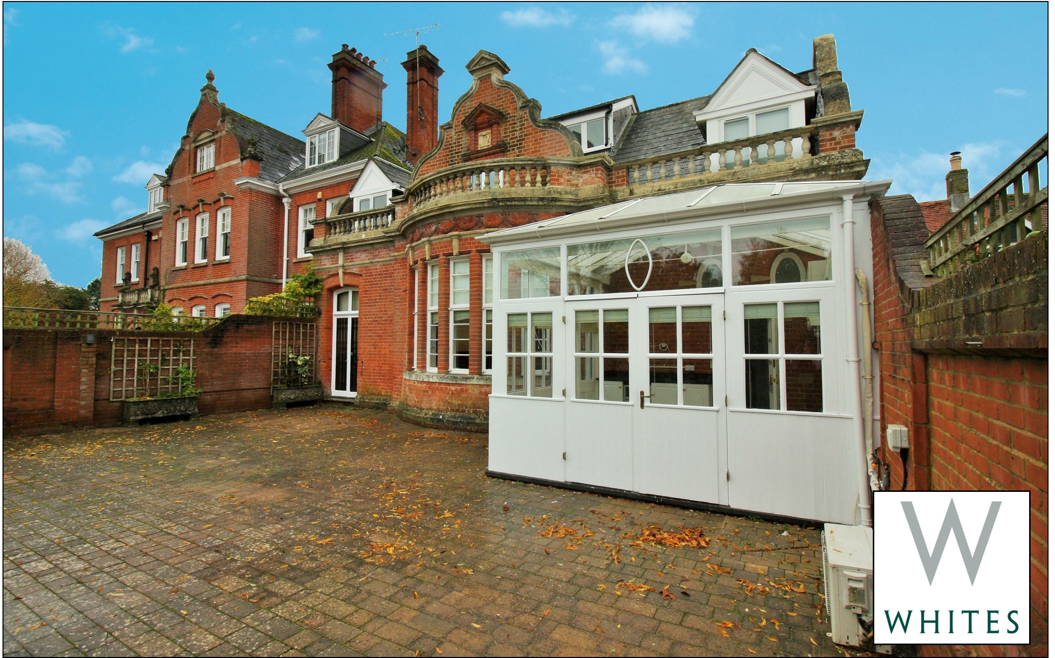
The Ballroom, Meshwick Hall Mesh Pond, Downton, Salisbury, Wiltshire, SP5 2NQ